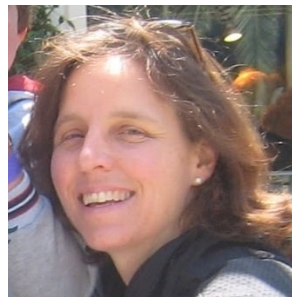
Megan Smith was appointed chief technology officer for the federal government in 2014.

Sixty-two percent of women in STEM fields aspire to senior management or C-suite positions. 8 Yet, women make up just 11 percent of chief information officer positions in the United States—although one is Megan Smith, a former Google executive appointed chief technology officer for the federal government in 2014. 9